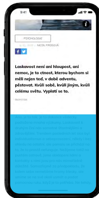
INTERSCROLLER MOBILE RECTANGLE